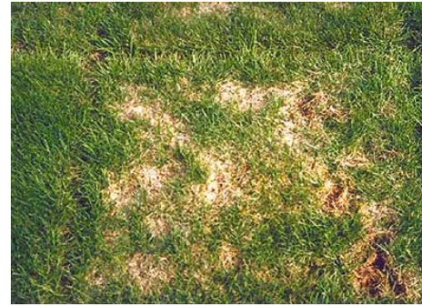
Lawn damage caused by webworm

The most severe damage usually shows up in mid July and August when the temperature is hot and the grass is not growing vigorously. In fact, most sod webworm damage is mistaken for heat and drought stress. Sod webworm-damaged lawns may recover with light fertilization and an application of an insecticide.